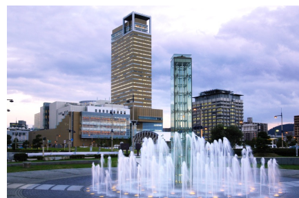
TAKAMATSU SYMBOL TOWER Sunport 2-1, Takamatsu City, Kagawa 760-0019 Japan TEL: +81-87-822-1707 https://www.symboltower.com/en/